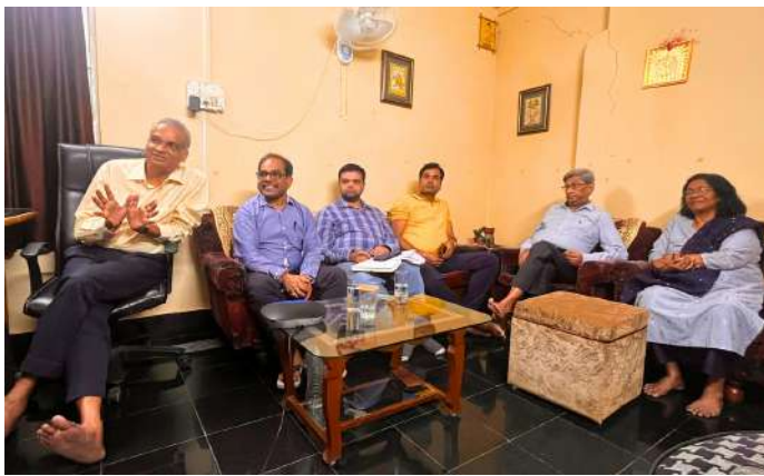
Image 1: Governing Body meeting